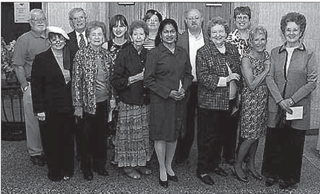
On April 19, Upper Chesapeake Health honored volunteers from Harford Memorial Hospital and Upper Chesapeake Medical Center at their annual Volunteer Appreciation Dinner. Held at Richlin Ballroom, there were 398 volunteers and their guests in attendance.