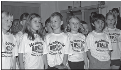
Meadowvale Elementary School students were recognized recently for completing the 2008 Patriot Program.